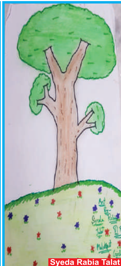
Syeda Rabia Talat