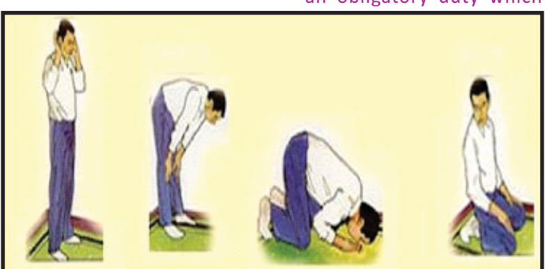
Full Body Exercise, Five times a day.

of the 5 pillars of Islam. It is an obligatory duty which 2)